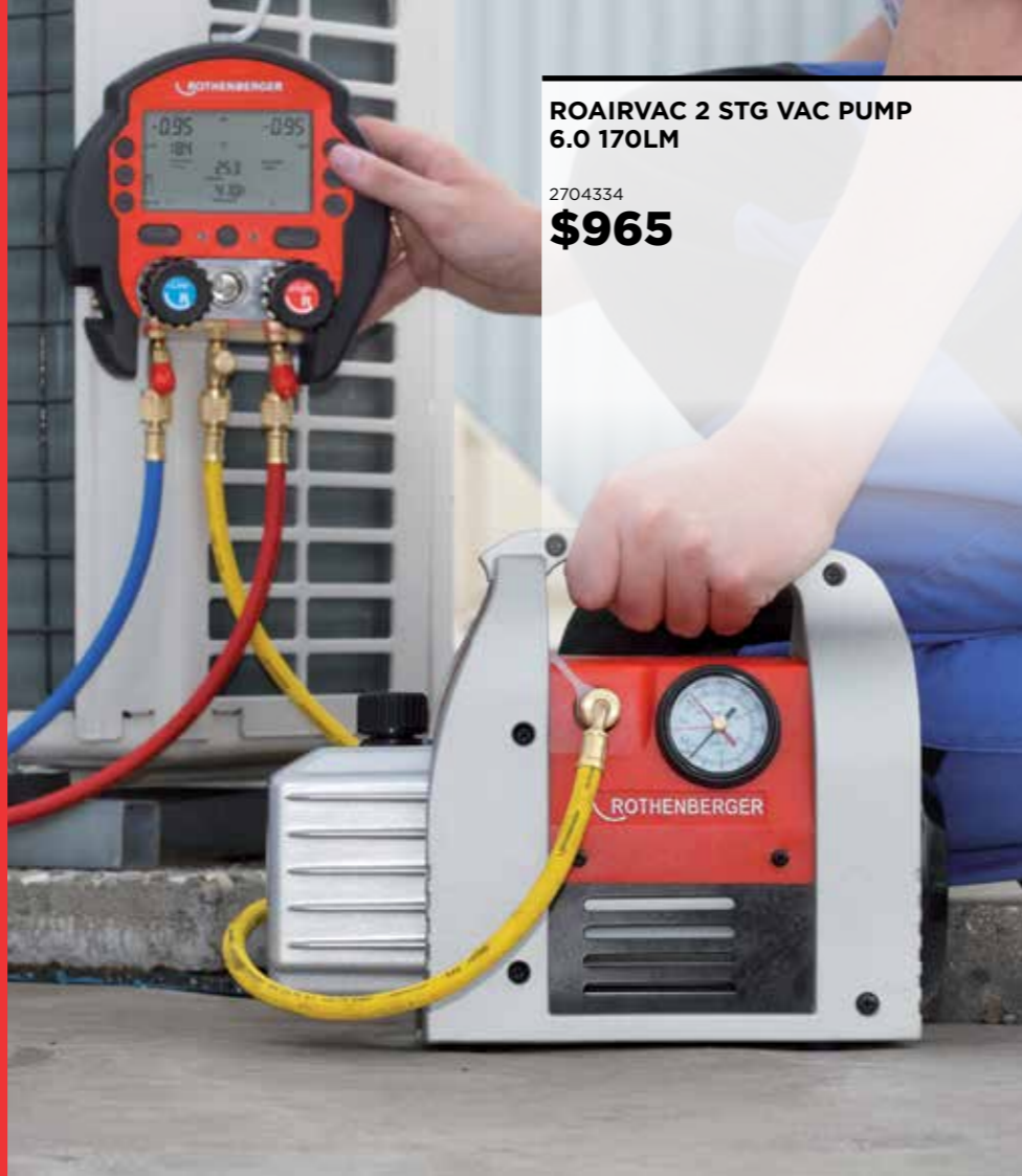
ROAIRVAC 2 STG VAC PUMP 6.0 170LM

The choice of professionals, ROTHENBERGER provides complete solutions for rapid pipe installation with an extensive range of the highest quality German engineered products.